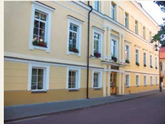
Ministry of Education and Science

Goals and objectives of the Ministry of Education and Science: to implement the national system of formal and non-formal education which secures social attitudes in favour of education and creates conditions for lifelong learning in a changing democratic society; to implement the state policy of science and studies in accordance with the Law on Science and Studies and other legal acts; to coordinate the activity of Lithuanian institutions of science and studies, etc. In order to implement the assigned tasks, the Ministry develops one-year and long-term educational investment programmes, approves requirements for the regulations of state-run and municipal schools; approves the general curriculum content of formal education, and achievement levels; organizes and coordinates the accreditation of the secondary education programme; approves the procedure of consecutive learning under general education programmes